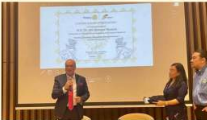
Question and answer session at Rotary Club