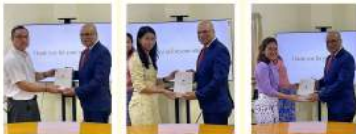
Ambassador handing over the grants to the students