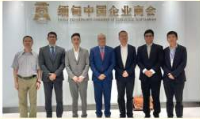
With Chinese businessmen