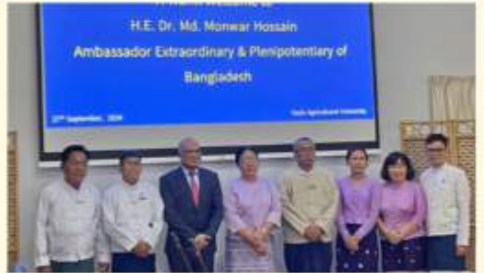
Faculties of Yezin Agricultural University