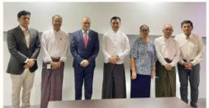
With the office bearers of MLA