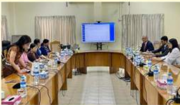
Presentation of thesis at UPH