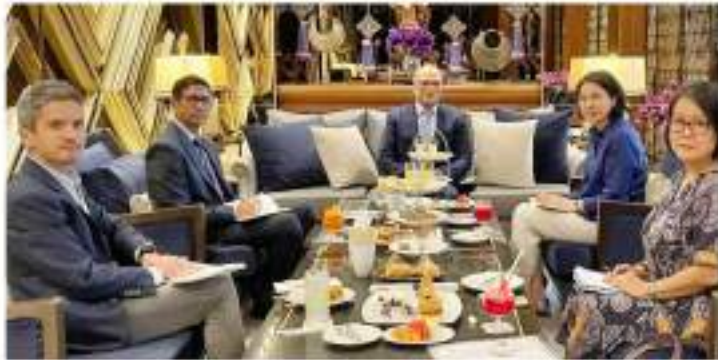
UNHCR team meets with the Ambassador