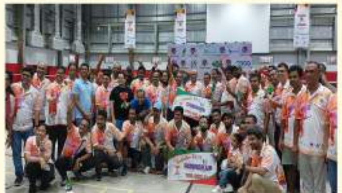
Participants of the Badminton Fest-2024