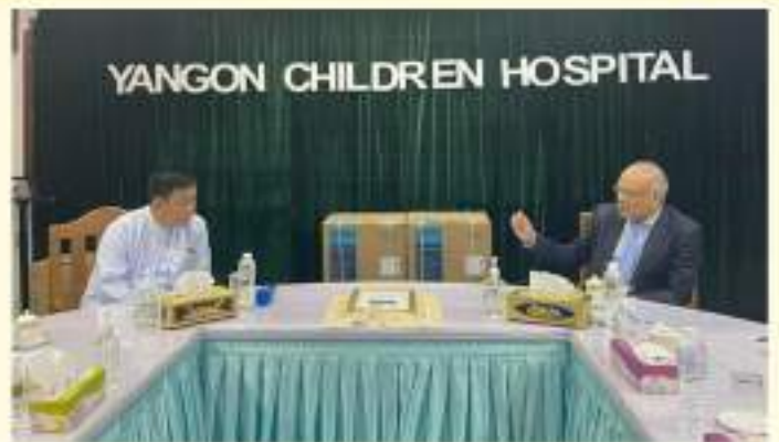
Discussion with the Senior Medical Superintendent