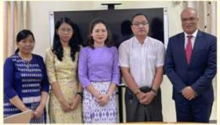
Ambassador with Rector and recipients of grant