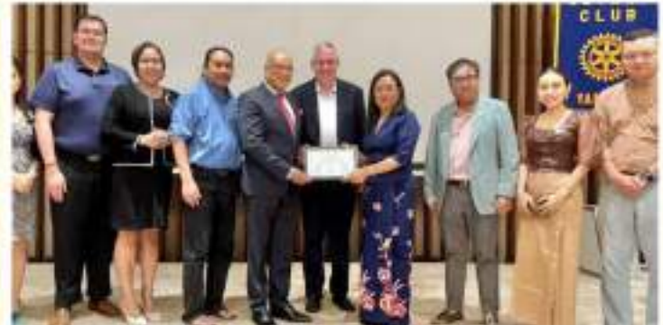
With the Officials of Rotary Club of Yangon