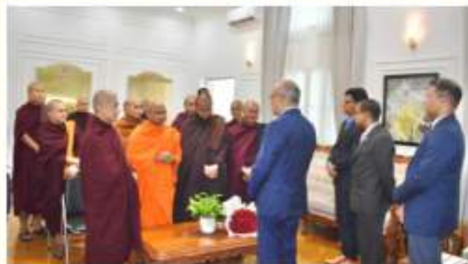
Exchanging greetings with the Bangladeshi students in ITBMU