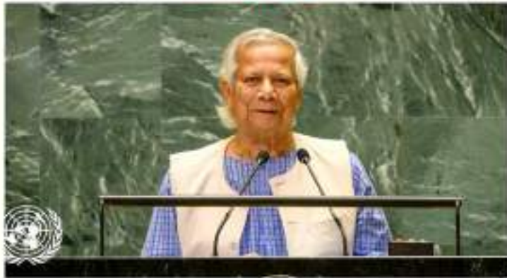
Chief Adviser addressing on the sidelines of the UNGA

Chief Adviser of the Interim Government of Bangladesh Professor Dr. Muhammad Yunus sought the international community's continuous focus on the Rohingya crisis and warned that the whole region, not just Bangladesh, could be in trouble otherwise. He was speaking at a high-level discussion on the Rohingya crisis held on the sidelines of the United Nations General Assembly (UNGA) on 27 September 2024 in New York. The Chief Adviser proposed that the international community revisit its approach to the Rohingya crisis, including, reenergizing the Joint Response Plan and supporting the justice and accountability mechanism. He said the UN Secretary General may convene an all-stakeholders' conference on the Rohingya crisis as soon as possible.