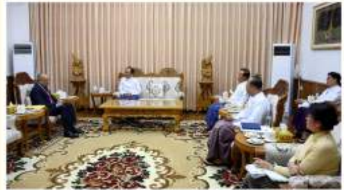
Meeting with the Health Minister & senior officials