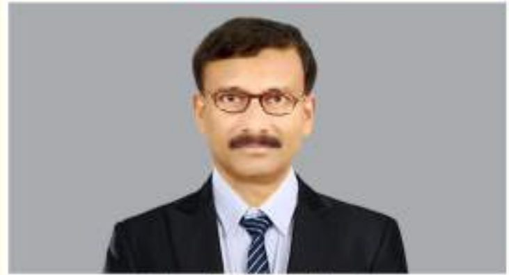
Ambassador M Touhid Hossain Foreign Affairs Adviser

H.E. Mr. M Touhid Hossain has assumed the charges of the Foreign Affairs Adviser of the interim government of Bangladesh on 08 August 2024. Ambassador Md. Touhid Hossain is a career diplomat who joined Bangladesh Foreign Service in 1981. In his diplomatic career Mr. Hossain served in Bangladesh High Commission in New Delhi, Deputy High Commission of Bangladesh in Kolkata, High Commissioner of Bangladesh to South Africa, and Principal of the Foreign Service Academy. He was also a former foreign secretary of Bangladesh.