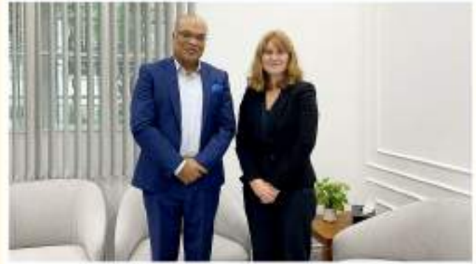
Meeting with the HOM of the Norway Embassy, Yangon