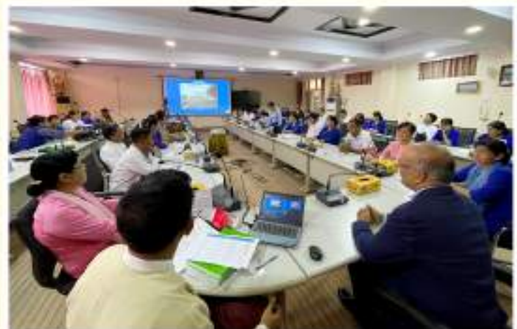
Ambassador addresses the research students & faculties