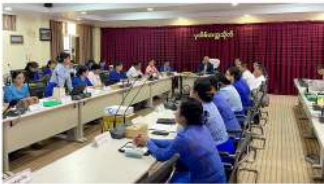
Exchange of views with the research fellows of PU