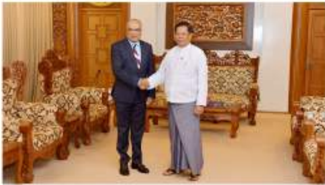
Welcomed by the Foreign Minister at the Ministry