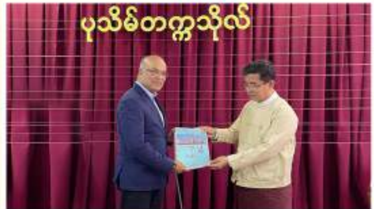
Rector of the Patheingyi University welcomes the Ambassador