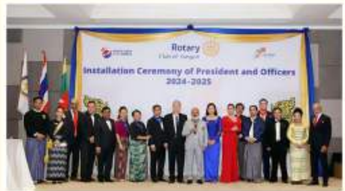
Newly installed committee of the Rotary Club of Yangon