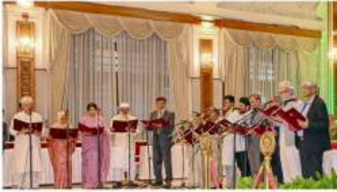
Advisers of the newly formed Interim Government of Bangladesh sworn in at the Bangabhaban