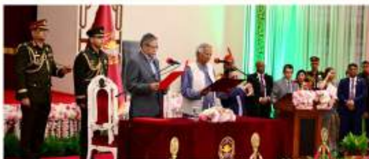
Chief Adviser Sworn in

In an address to the nation on 25 August 2024, Hon'ble Chief Adviser H.E. Professor Dr. Muhammad Yunus highlighted the support of the international community towards Bangladesh and the priorities of the interim government. He expressed keen interest of his government to work with the international community to find a pragmatic solution to the Rohingya crisis. The Chief Adviser also said that Bangladesh will maintain friendly relationship with all the countries and the basis of foreign policy will be mutual trust, confidence and cooperation.