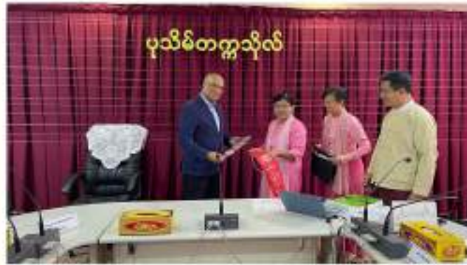
Pro-rectors of the Pathein University greet Ambassador