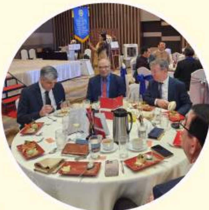
Guests attending the reception

It may be mentioned that the Patheingyi University was established in 1996. It is Located in one of the most commercially vibrant cities of Myanmar, Patheingyi. It has a land area of 331.5 acres, comprising with 15 departments, 06 hostels, 370 faculties along with other quality education facilities.