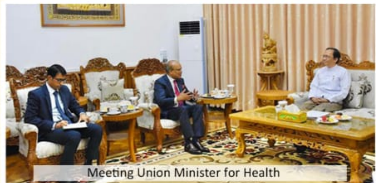
Meeting Union Minister for Health