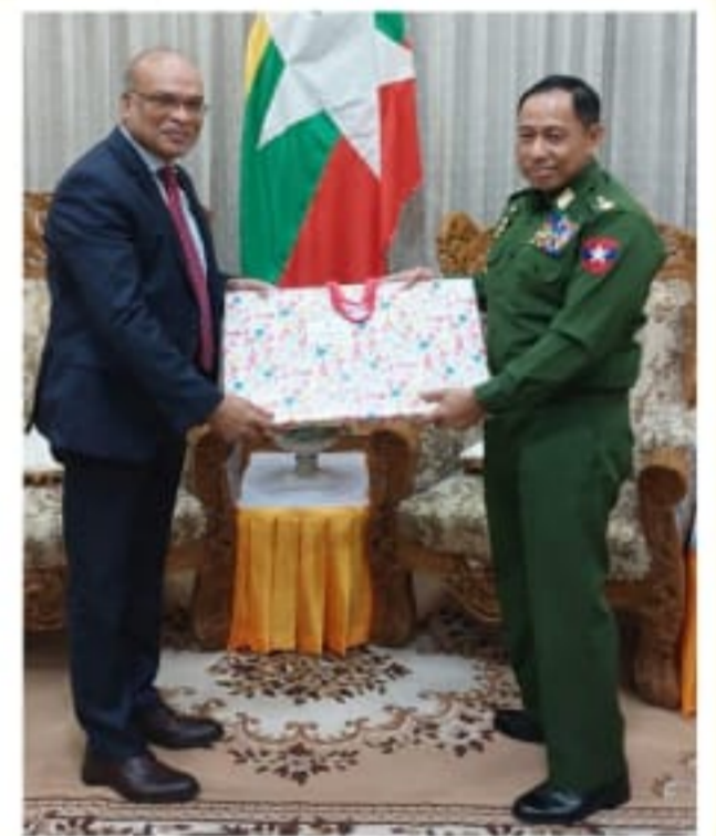
Meeting Home Minister

The Ambassador then met with the Hon'ble Union Minister for Home of Myanmar at Office 10. During the meeting, he categorically requested the Minister to facilitate repatriation of the arrested reported Bangladeshi nationals in Myanmar who got amnesty by Myanmar government and asked for consular access to the arrested/sentenced reported Bangladeshi nationals for in-person interview in different jails/police stations of Myanmar. Ambassador also urged for quick decision from the Minister to process verification and subsequent repatriation of Bangladeshi nationals by the Bangladesh Missions in Myanmar before the border meeting between the relevant agencies of the two countries.