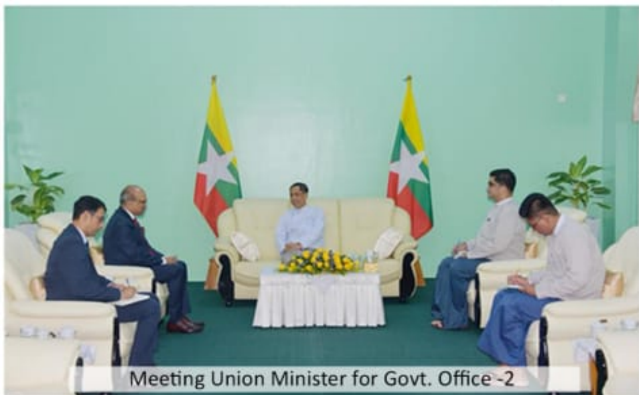
Meeting Union Minister for Govt. Office -2

H.E. Dr. Md. Monwar Hossain, Ambassador Extraordinary and Plenipotentiary of the People's Republic of Bangladesh to Myanmar met with the Hon'ble Deputy Prime Minister and Union Minister for Foreign Affairs U Than Swe at his office on 05 September 2023, Hon'ble Union Minister for Government Office-2, H.E. U Ko Ko Hlaing and Hon'ble Health Minister H.E. Dr. Thet Khaing Win on 07 September 2023 at their respective offices.