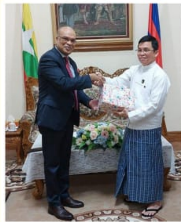
Meeting Immigration Minister

Ambassador in the meeting with the Immigration Minister highlighted the recent developments in Director General level talks between Bangladesh and Myanmar where both the parties expressed keen interest to commence repatriation at the earliest possible. He underscored the importance of completing verification of the displaced Myanmar people by the Myanmar's authorities as soon as possible. Ambassador also urged on the voluntary repatriation of the displaced Myanmar people to their original place of living.