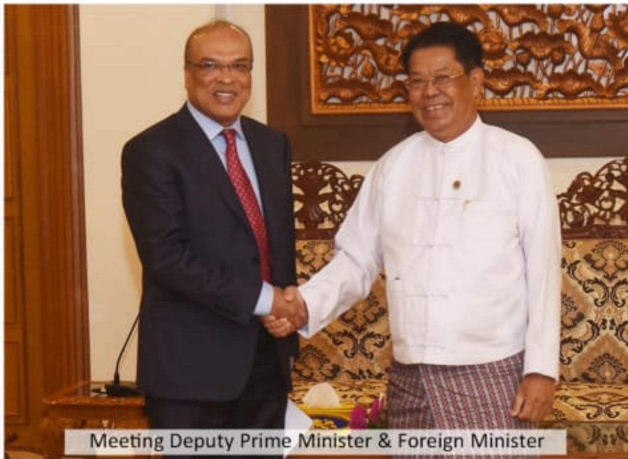
Meeting Deputy Prime Minister & Foreign Minister

Ambassador meets with the Ministers of Myanmar Government following presentation of credentials