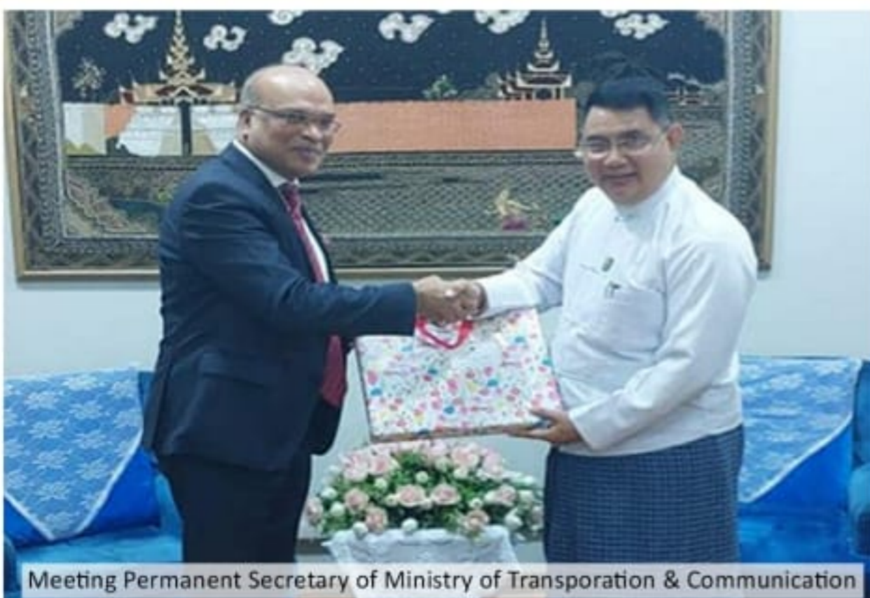
Meeting Permanent Secretary of Ministry of Transportation & Communication

The Ambassador then met with the Hon'ble Union Minister for Home of Myanmar at Office 10. During the meeting, he categorically requested the Minister to facilitate repatriation of the arrested reported Bangladeshi nationals in Myanmar who got amnesty by Myanmar government and asked for consular access to the arrested/sentenced reported Bangladeshi nationals for in-person interview in different jails/police stations of Myanmar. Ambassador also urged for quick decision from the Minister to process verification and subsequent repatriation of Bangladeshi nationals by the Bangladesh Missions in Myanmar before the border meeting between the relevant agencies of the two countries.