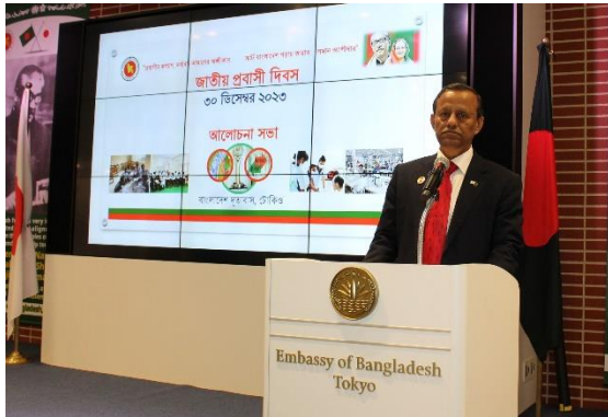
Ambassador Shahabuddin Ahmed is delivering speech on National Expatriates Day 2023

At the beginning of the discussion program, the messages given by the Hon'ble President, Hon'ble Prime Minister, Hon'ble Home Minister, Hon'ble Foreign Minister and Hon'ble Minister of Expatriate Welfare and Overseas Employment on the occasion were read out.