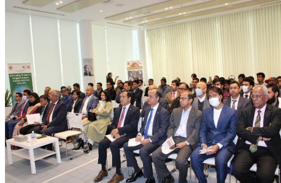
Expatriate Bangladeshi, members of Bangladesh Community in Japan and embassy officials attending the program on National Expatriates Day 2023

bringing more workers from Bangladesh, by sending remittances through legal channels and ensuring the financial stability of their families by joining the Universal Pension System.