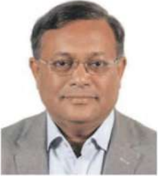
Dr. Hasan Mahmud, MP Foreign Minister of Bangladesh

Today is 26th March, the Great Independence and National Day. On this auspicious occasion, I extend my sincere greetings and congratulations to all Bangladeshis living in the country and abroad.