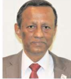
Shahabuddin Ahmed Ambassador of Bangladesh

On this auspicious day, I extend warm greetings to you all. Today, I remember with profound respect our Father of the Nation Bangabandhu Sheikh Mujibur Rahman. I also recall the contribution and supreme sacrifices of our four national leaders, valiant martyrs and freedom fighters, and support of our foreign friends.