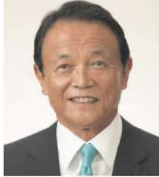
ASO Taro President of the Japan-Bangladesh Parliamentary Friendship League

On the occasion of the Independence and National Day of the People's Republic of Bangladesh, I would like to express my heartfelt congratulations to the Government and the people of Bangladesh on behalf of the Japan-Bangladesh Parliamentary Friendship League.