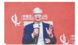
Apple CEO Tim Cook speaks at the China Development Forum in Beijing on Sunday.

The Apple chief returned to the CDF at a time when Beijing wants to show it is open for business. Cook was also one of the marquee names on last year's list of participants, which was the first time the event was held in-person after three years of COVID-19 isolation. He spoke with China Premier Li Qiang and other CEOs of international corporations following Li's opening speech.