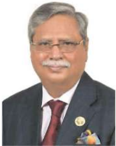
Mohammed Shahabuddin President of Bangladesh

26th March—The Great Independence and National Day of Bangladesh. On this auspicious occasion, I extend my heartfelt greetings and warm felicitations to my fellow countrymen living at home and abroad. On this day, I remember with profound respect the architect of our independent Bangladesh, the greatest Bangalee of all time, Father of the Nation Bangabandhu Sheikh Mujibur Rahman. On the fateful night of March 25, 1971, the invading forces of Pakistan unexpectedly attacked the unarmed Bangladesh. In the early hours of March 26, Father of the Nation Bangabandhu Sheikh Mujibur Rahman officially declared the Independence of Bangladesh. We achieved an independent and sovereign Bangladesh through a nine-month long Liberation War under the able leadership of Bangabandhu. I recall with deep respect the millions of mar-