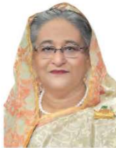
Sheikh Hasina Prime Minister of Bangladesh

Today is the great Independence and National Day. On this auspicious occasion, I extend my sincere greetings and congratulations to all the Bangladeshi citizens living in the country and abroad.