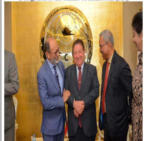
With Chairman, Federation of Kurdistan Chambers