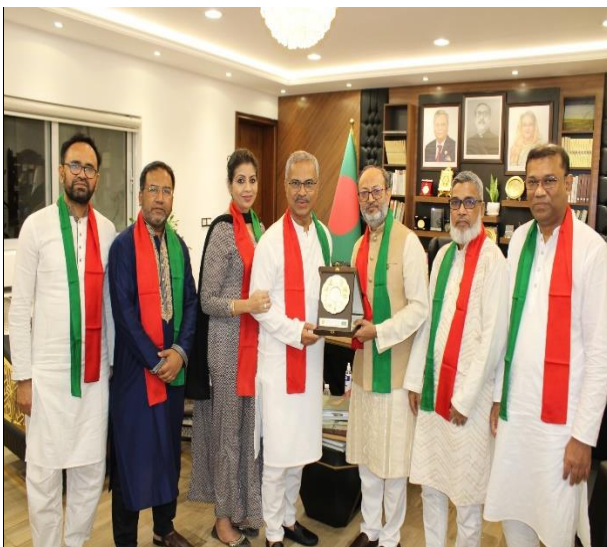
The delegation in the Embassy