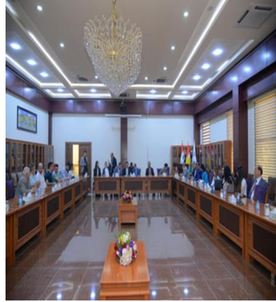
Meeting in Erbil Chamber