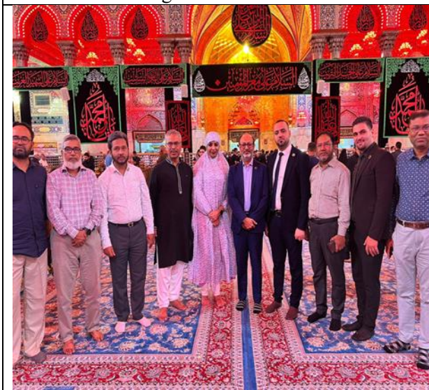
Delegation at the Shrine of Hazrat Ali (RA)