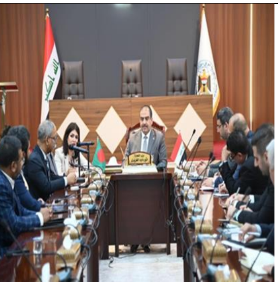
Delegation in meeting with Hon'ble Minister of Trade