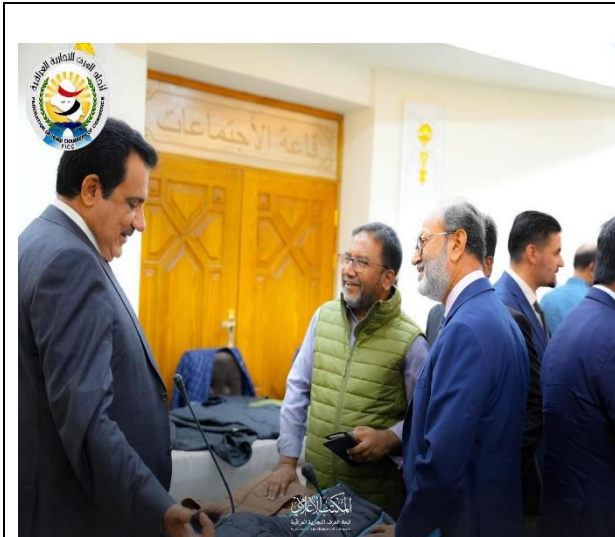
B2B meeting at FICC in Baghdad