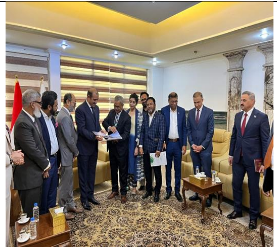
Delegation with Hon'ble Minister of Industry & Minerals