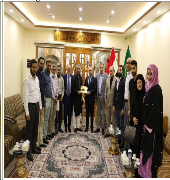
At the Najaf Chamber