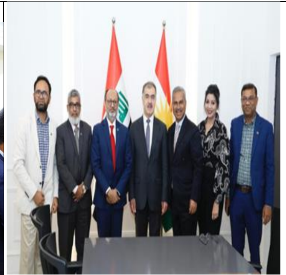
After meeting with Hon'ble DFR Minister