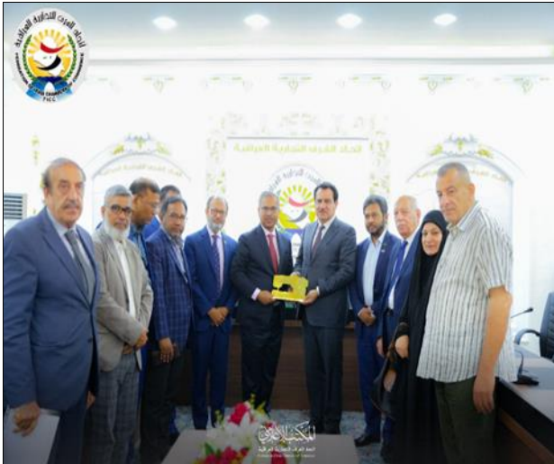
Delegation at the FICC