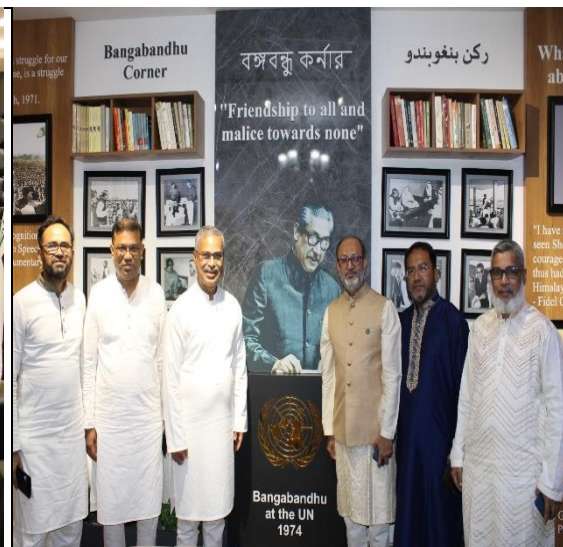
The delegation at the Bangabandhu Corner