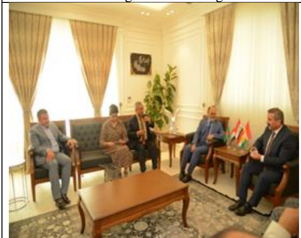
In meeting with Chairman, Kurdistan Board of Investment