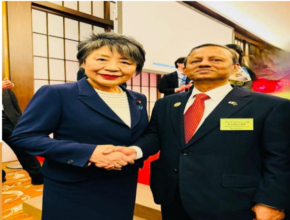
Ambassador Shahabuddin Ahmed exchanging warm greetings with Minister for Foreign Affairs Kamikawa Yoko

The program titled “Niigata, the Treasure Box of Japan” was held on 23 January 2024.