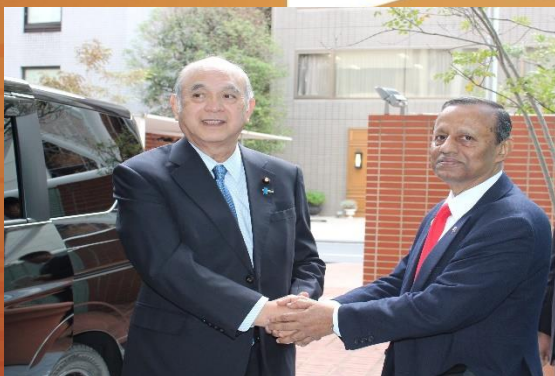
Ambassador Shahabuddin Ahmed welcomed State Minister for Foreign Affairs of Japan Tsuge Yoshifumi at the Bangladesh Embassy

State Minister for Foreign Affairs of Japan Tsuge Yoshifumi paid a courtesy call on Ambassador Shahabuddin Ahmed on 24 January at the Bangladesh Embassy in Tokyo.