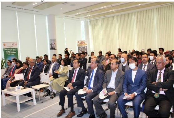
Expatriate Bangladeshi, members of Bangladesh Community in Japan and embassy officials attending the program on National Expatriates Day 2023

bringing more workers from Bangladesh, by sending remittances through legal channels and ensuring the financial stability of their families by joining the Universal Pension System.